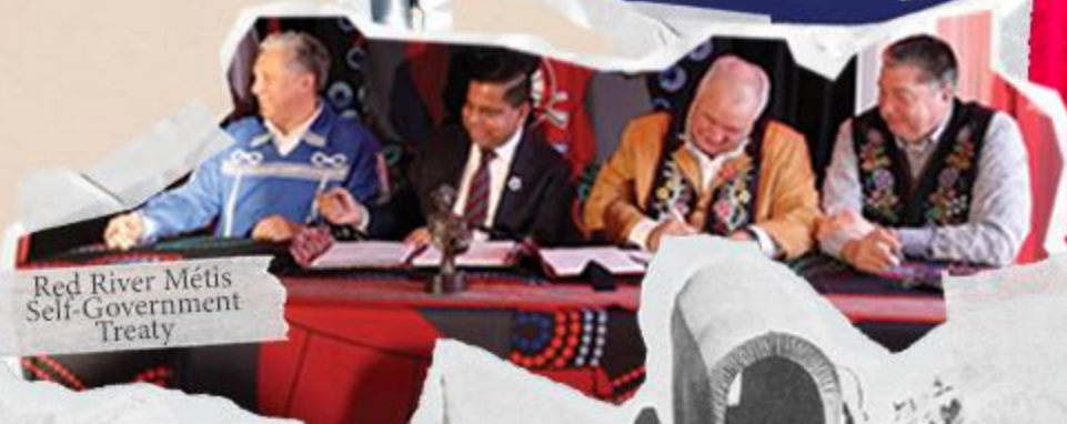
Red River Métis Self-Government Treaty