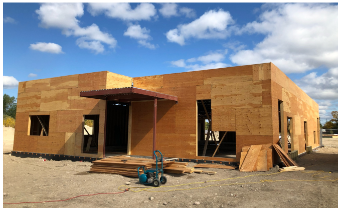
Li Pchi Taan Faan Childcare Centre, The Pas