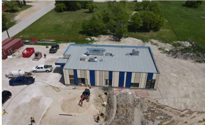
Li Pchi Pwayson Childcare Centre, St. Laurent