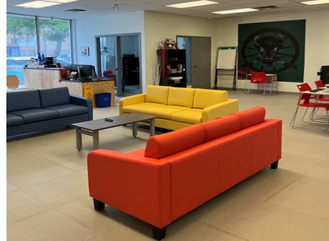
Fre Maachi Resource Centre