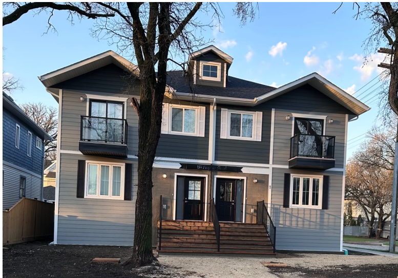
184 Eugenie Street in St. Boniface