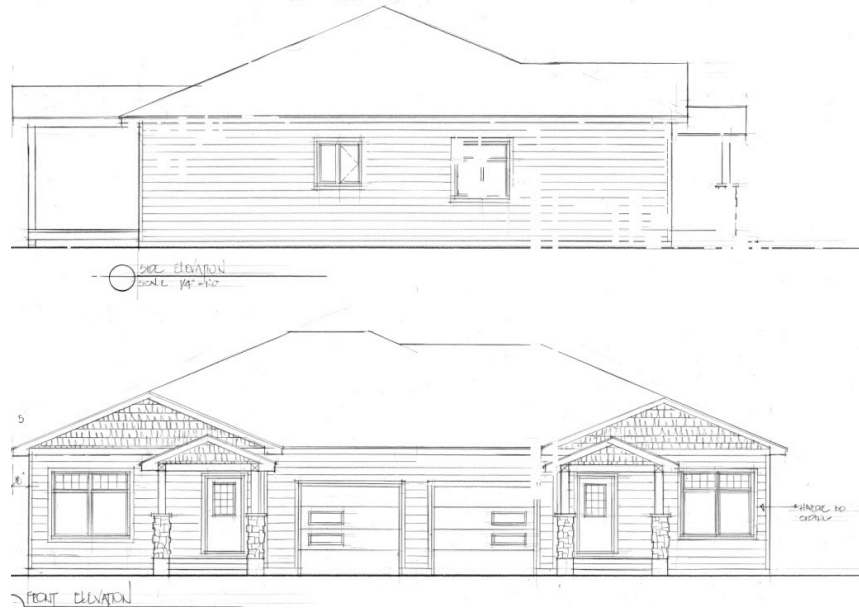
Duplex Drawings, St. Georges