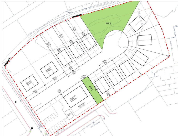
157 Bell Avenue Subdivision, The Pas