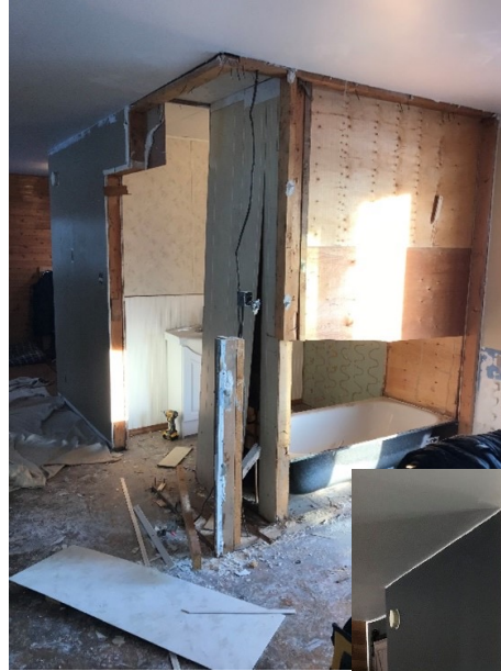
HELP renovation before & after