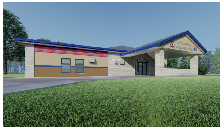
IWS Little Infinity Childcare Centre, St. Andrews