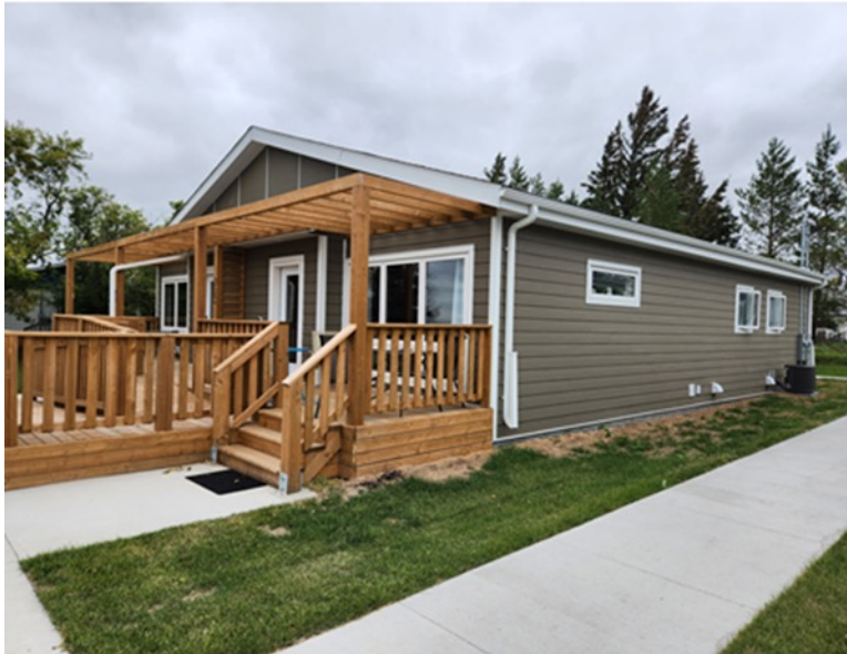
Seniors Duplex, Binscarth