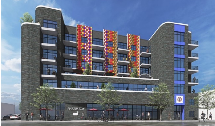
Eveline 55+ apartments in Selkirk