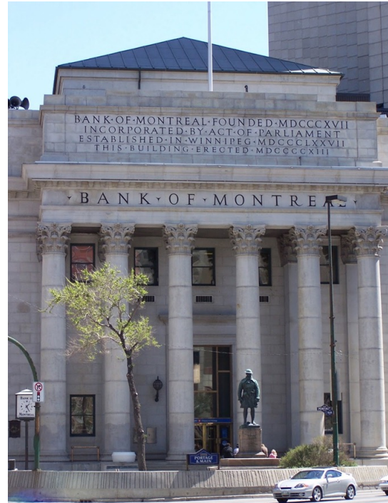
335 Main St., future home of the Métis National Heritage Centre