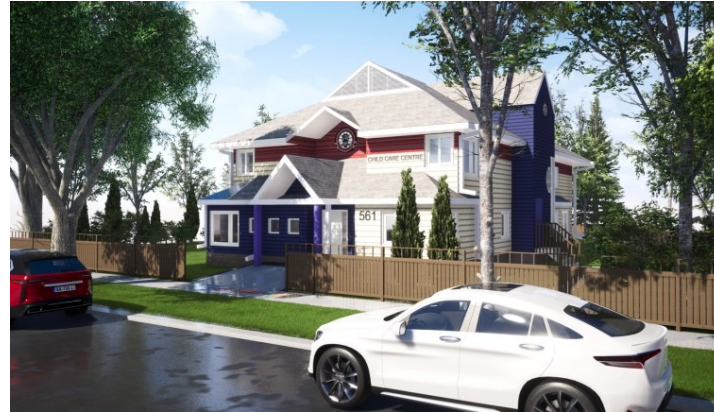
Louis Riel Childcare Centre, St. Boniface