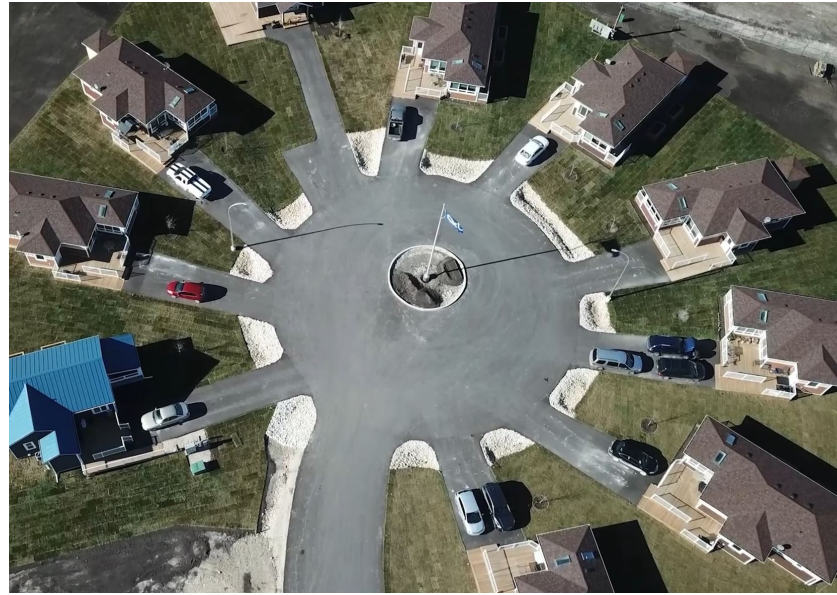
Frank Bruce Seniors Centre, St. Laurent