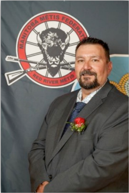
Minister Shawn Nault